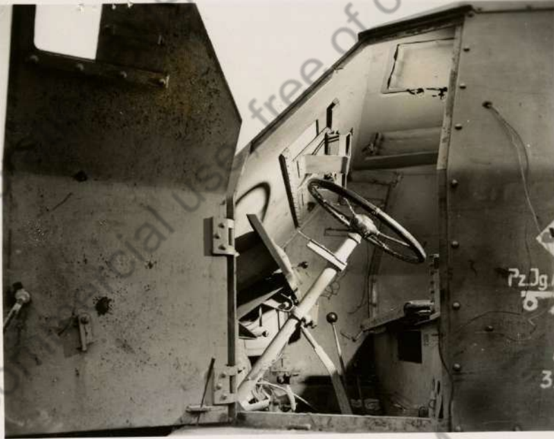
Photo No. 4.. Interior of cab showing vision ports and escape hatches in cab top.