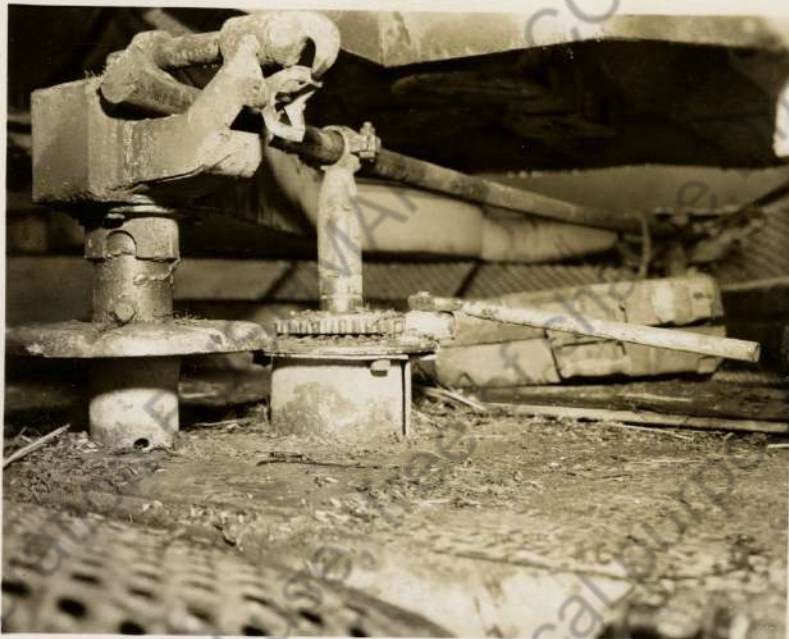
Photo No. 5 Support and holding jack for right front outrigger of 3.7 cm Flak 43.