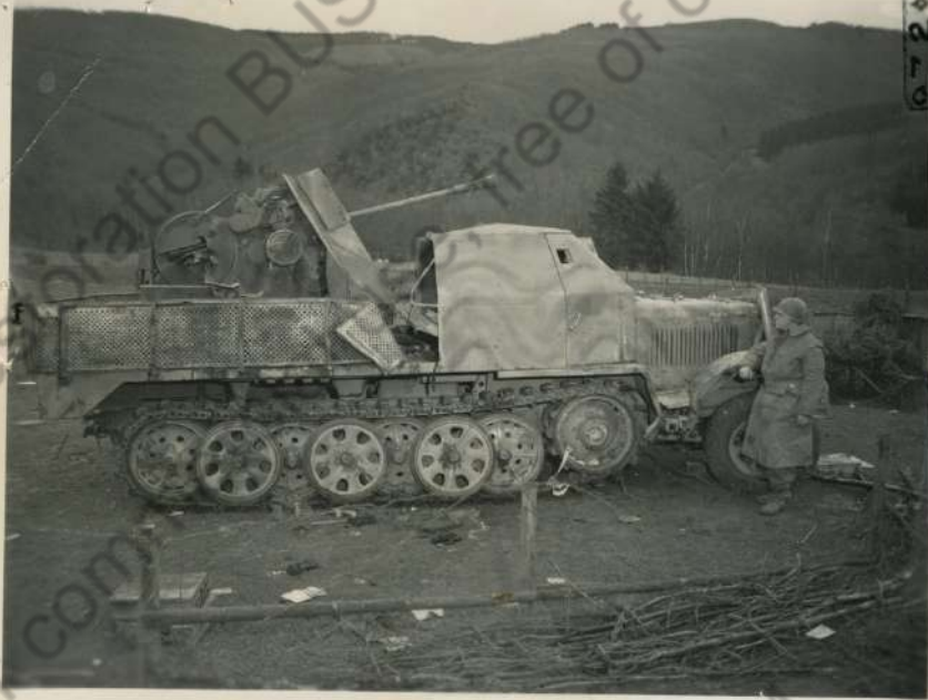
Photo No. 1. 3.7 cm Flak 43 on 8-ton semi-tracked vehicle, Sd.Kfz. 7/1