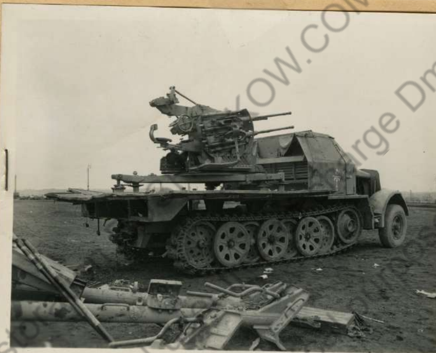
Photo No. 2. 2 cm Flakvierling 38 on 8-ton semi- tracked vehicle Sd.Ffz. 7/2. The sides of the body are shown lowered to form the firing platform. The seat for the gun crew at the rear of the cab is folded up.