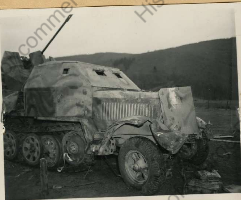
Photo No. 3. Armored cab and radiator shield.