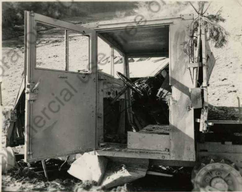
Photo No. 1 Winterized cab on Maultier semi- tracked vehicle.