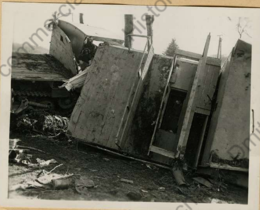
Photo No. 3. Body construction of vehicles. Maultier vehicle is in background