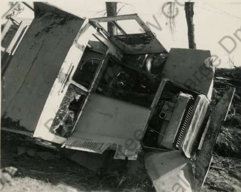
Photo No. 2. Cab and hood of vehicle on chassis of light armored car. Section of hood over radiator is made in two pieces that are hinged at the side.