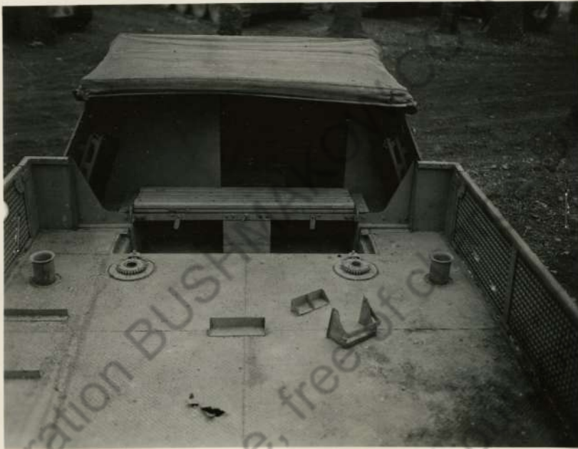
Photo No. 2. Body and crew seat. Note the tubular uprights for mounting an AA gun and the gears and pinions for the leveling jacks.