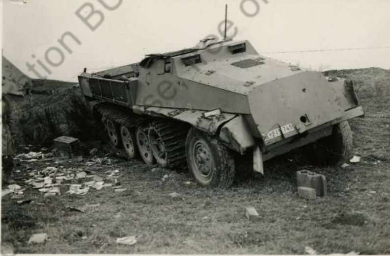
Photo No. 1. SWS tractor with armored cab. Escape hatch in top of cab and vision ports are shown opened.