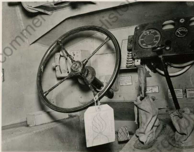
Photo No. 3. Driver's controls.