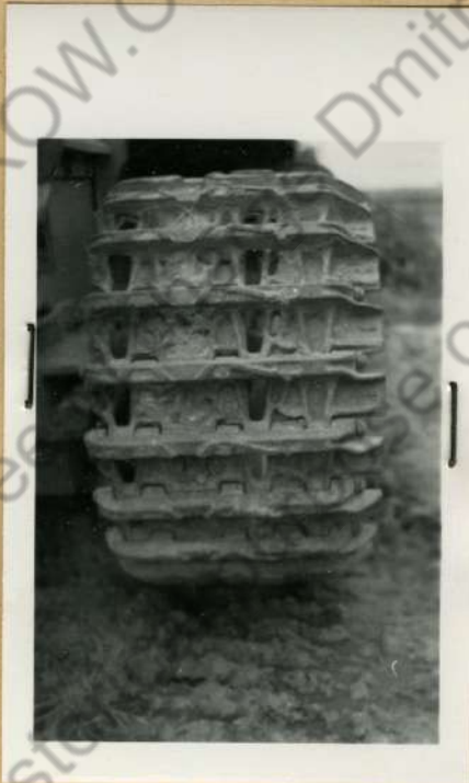
Photo 3: Construction of track. Note arrangement of chevron-type spuds on sole bars.