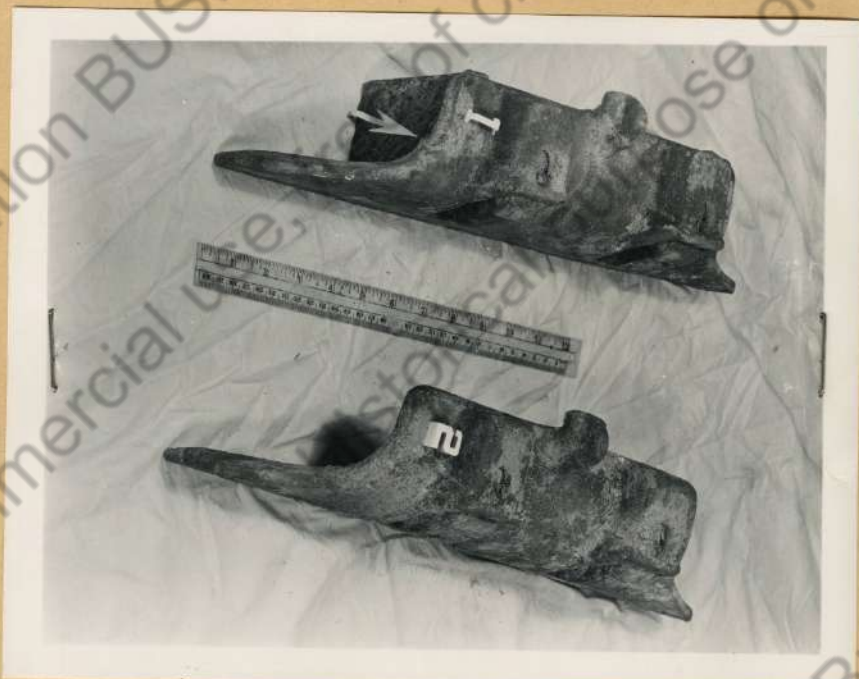
Photo 2 Traction side of grousers showing reinforcing plate modification. Arrow points to weld.